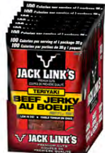
35g Beef Jerky 100 Calorie Pack - 12 packages per box