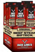
28g Original Beefsteak 12 Convenient Snacks per Box

Jack Links Beef Jerky Products Fundraiser This fundraising program allows groups to sell the various Jack Links Beef Jerky products that are well known and enjoyed across North America 40-50% Profit