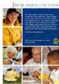
“We’re Helping the Young”