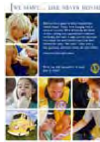
“We Serve...Like Never Before”