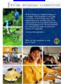
“We’re Building Community”