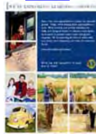
“We’re Exploring, Learning, Growing”