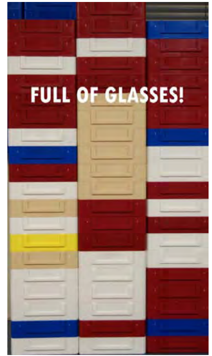
James is making more glasses than ever.

tellerbee@lionslighthouse.org 404.325.3630 x 311