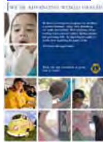
“We’re Advancing World Health”