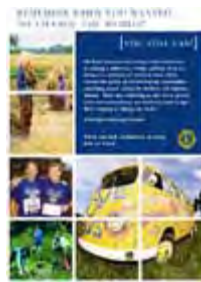
“Remember When You Wanted to Change the World?”

For more information, email boomers@lionsclubs.org