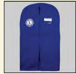
Garment Bag US$4.90