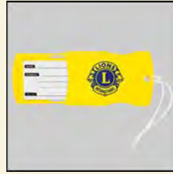
Plastic Luggage Tag US$2.75