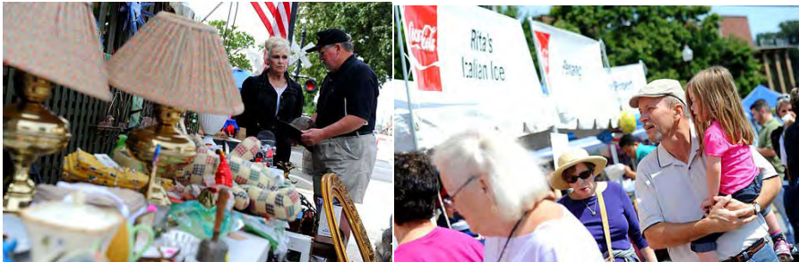
2011 Taste of Chamblee photos