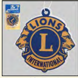
Paper Air Freshener US$2.00