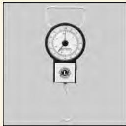
Luggage Scale (Weighs up to 80lb.) US$11.85