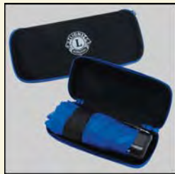
Folding Umbrella US$12.30