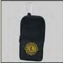
Multi-Purpose Case (3-1/4" x 6-1/4") US$4.35

For your daily commute, while running errands, or on your summer road trip, you can find a great selection of all items at the Lions Shop!