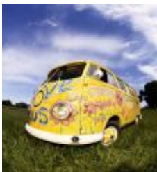
“Change the World”

For more information, email boomers@lionsclubs.org