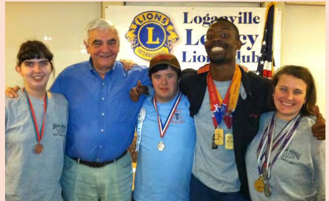
Joined us at our Feb. meeting to kick off the fundraising and volunteer efforts of LLLC We will be cheering them on!