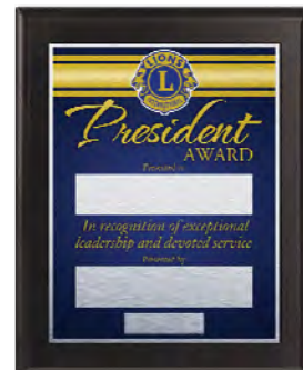
President Award - US$18.50