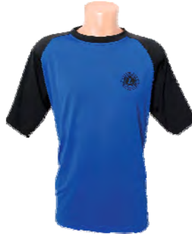
Performance Jersey - US$29.50- US$31.50