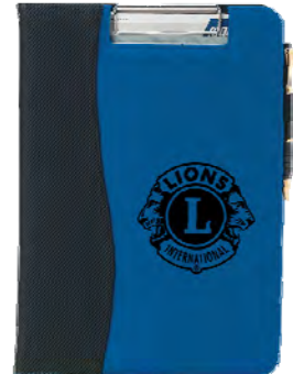
Clip Board Portfolio - US$16.50