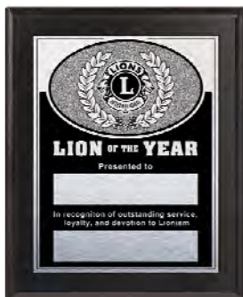
Lion of the Year Award - US$16.50