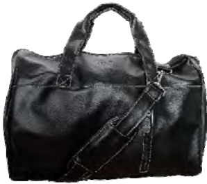
Carry On Bag - US$50.00