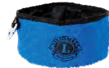
Folding Dog Bowl - US$6.50