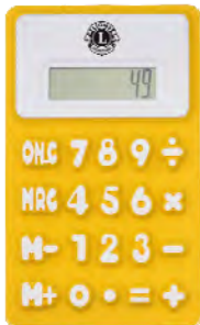
Flex Calculator - US$6.50