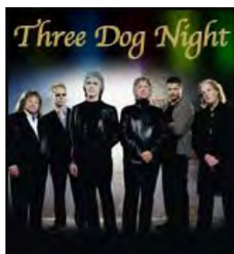
Three Dog Night March 9, 2013 7:00 PM

Tickets - On Sale February 1 Level 1: $37.00 + Handling