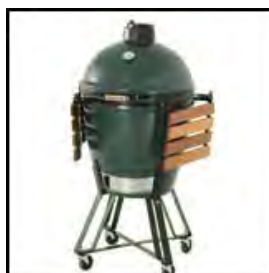
Georgia Mountain EggFest May 17 & 18, 2013

March 23, 2013 7:00 PM Tickets - On Sale February 8 Level 1: $41.00 + Handling