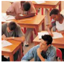
Increase Academic Achievement