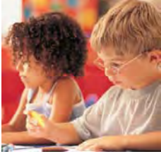
Decrease Problem Behavior

Providing high-quality, research-based youth development programs that unite the home, school and community