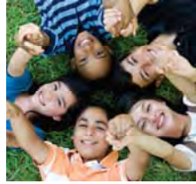
Improve Prosocial Behavior