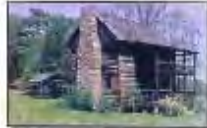
John Bowman House 1818