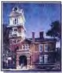
Gwinnett Historical Courthouse 1885