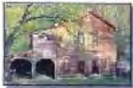
Swans (Freemans) Mill 1865