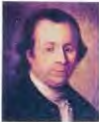
Button Gwinnett 2 nd Signer of the Declaration of Independence